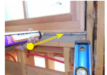
22. Apply sealant across the inside of the window sill and 8 inches up each side to terminate the inside of the membrane window pan.