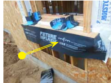
3. Lower bib applied