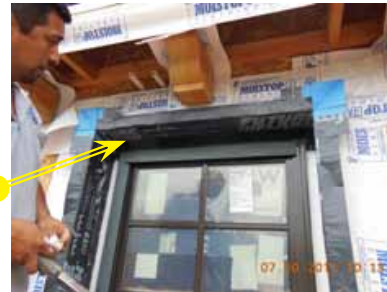
21. Apply top window flashing (Future Flash)