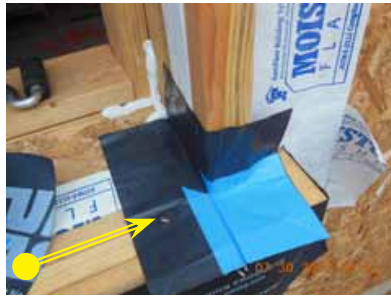
5. GS 106 A flashing corner set in place