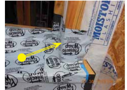
11. End dams cut and applied as shown. Use a 12" x 9" rectangular piece of Protecto Wrap as the end dam