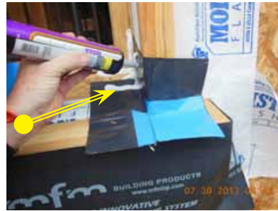
6. Sealant applied on top of GS 106 A flashing corner in preparation for GS 100 B corner