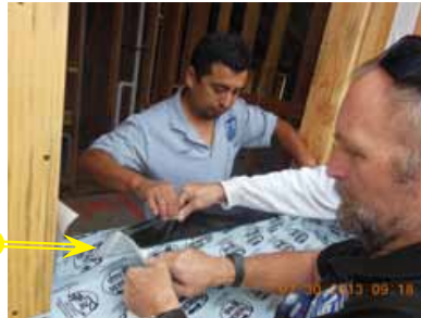
13. Apply Protecto wrap on to the framing sill and 6 inches up each trimmer.