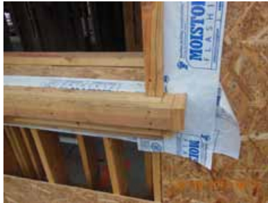
2. Exterior recessed framing condition