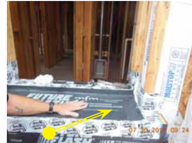
14. Apply lower course of window flashing (Future Flash)