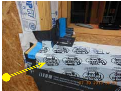
9. Begin to apply Protecto Wrap SAF flashing; layered to overlap minimum of 4 inches.