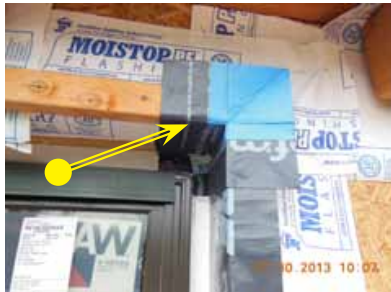
19 & 20. Apply top GS 106 A flashing corners into the wet sealant as shown. Wet sealant at top corners (not shown).