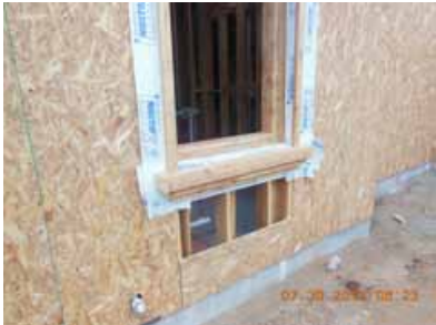
1. Exterior recessed framing condition