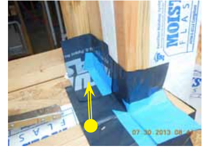
7. GS 100 B flashing corner set in place