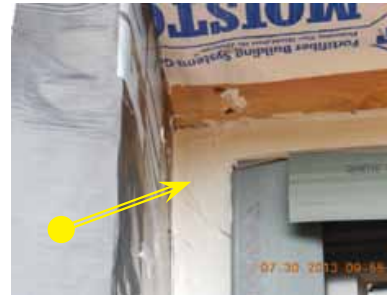
17. Apply sealant on top of nailing fin and butter flat