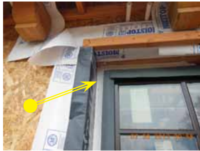
16. Apply sealant on top of nailing fin and butter flat