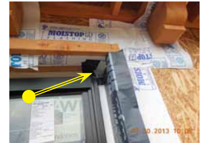
18. Apply top GS 100 B flashing corners into the wet sealant.