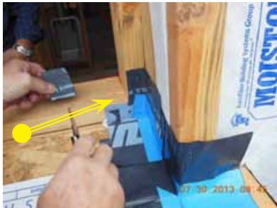
8. Trim GS 100 B corner @ framing sill