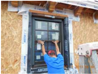
15. Apply side layers of window flashing (Future Flash) and set the window in place.