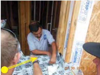
12. Apply Protecto wrap on to the framing sill and 6 inches up each trimmer.