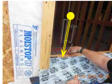
10. Protecto Wrap layered on to framing sill as shown